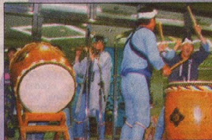
The Japanese American National Museum begins a three-week taiko drumming workshop for children March 11.